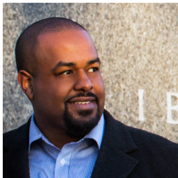
"The Fight for Black Men" Joshua DuBois The Daily Beast/Newsweek