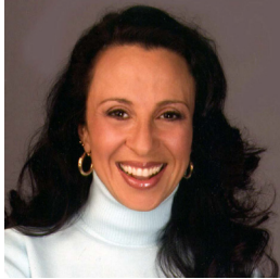
"Going to Rikers Island" Maria Hinojosa Latino USA (NPR)