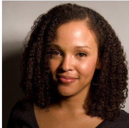
Men We Reaped: A Memoir Jesmyn Ward Bloomsbury USA